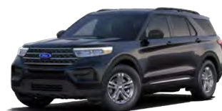
2021 Ford Explorer

For a full list of vehicles, please contact your local team at: efleets.com