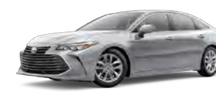
2021 Chrysler 300 4dr Sedan