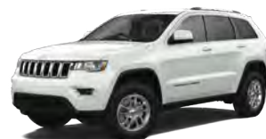
2021 Jeep Grand Cherokee