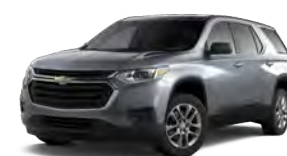
2021 Chevrolet Traverse