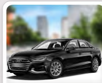
ENTRY LUXURY CARS