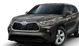
2021 Toyota Highlander