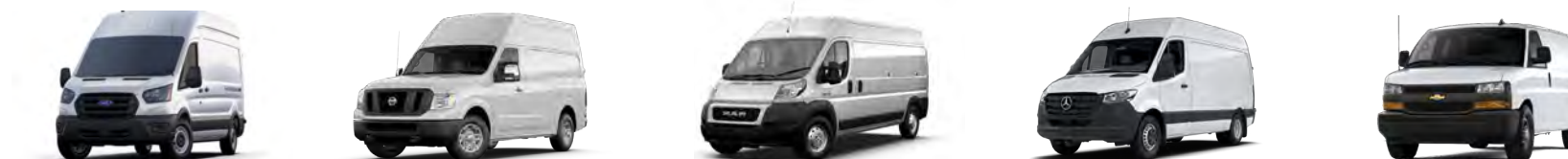
2021 Ford Transit-350 High Roof

For a full list of vehicles, please contact your local team at: efleets.com