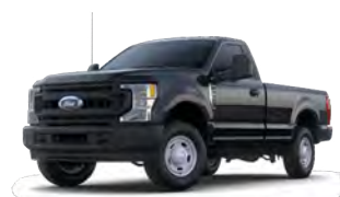
2021 Ford F-350

For a full list of vehicles, please contact your local team at: efleets.com