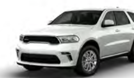
2021 Dodge Durango