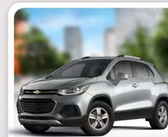
COMPACT CROSSOVER SUV