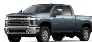
2021 Chevrolet Silverado 3500HD